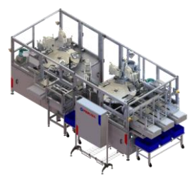
Small part robotic assembly system

Automatic palletizing system for buckets to save labor costs.